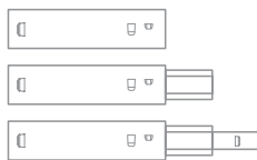
Telescopic Drawer Slide